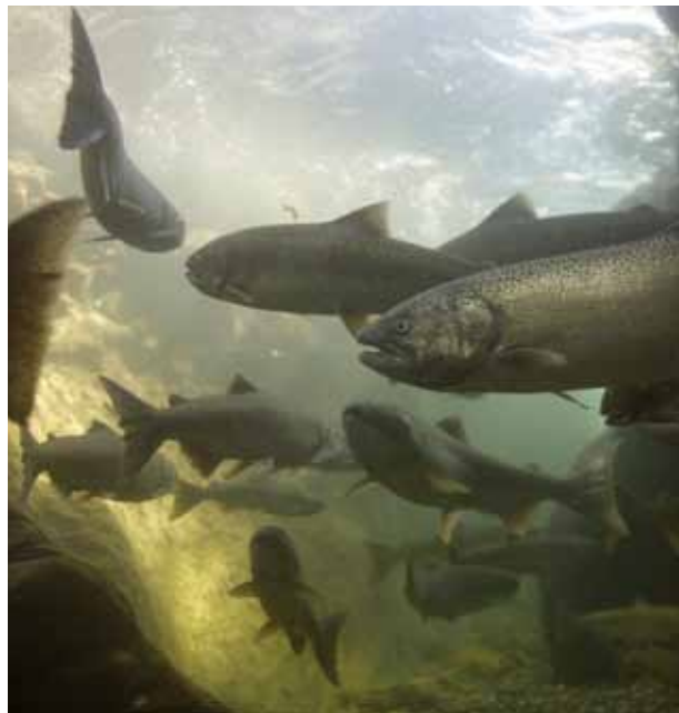
Spring Chinook, South Fork Gorge, Salmon River, Photo courtesy of Mike Bravo.